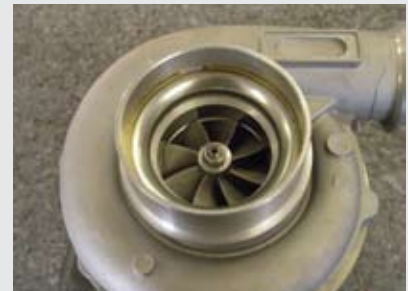
Non Genuine Turbocharger