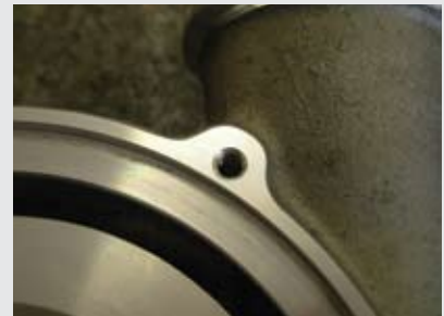
Cummins Genuine Housing