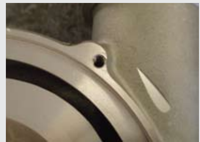
Non Genuine Housing