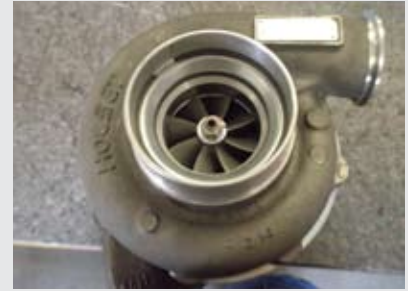
Cummins Genuine Turbocharger

Why risk your engines performance with a non genuine product. Choose Cummins Genuine. Contact your local Cummins branch or authorised dealer for a competitive price on a Genuine Cummins ReCon turbocharger today.